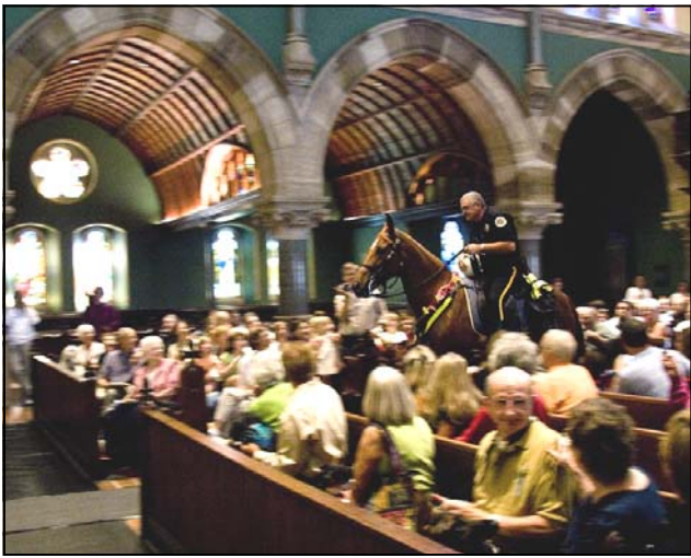
Photo Gallery - Blessing of the Animals